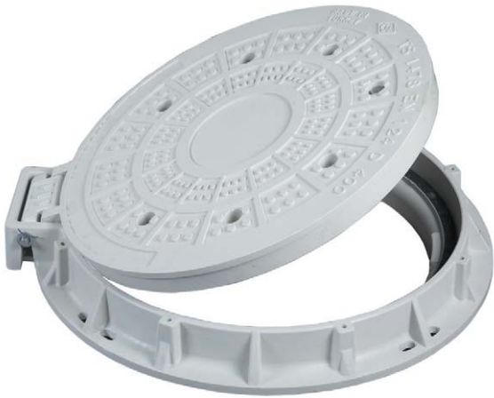
ANKO-MH-200 Manhole Cover Ø 550 mm