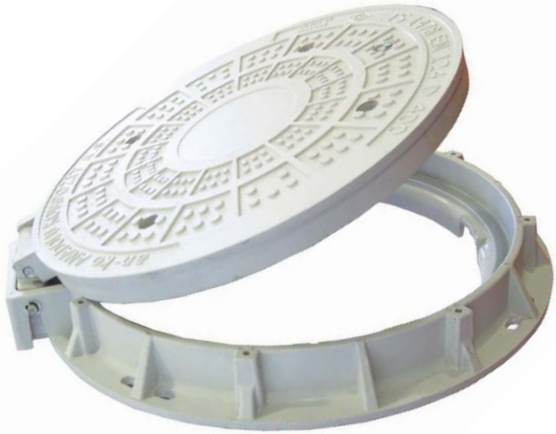
ANKO-MH-100 Manhole Cover Ø 600 mm